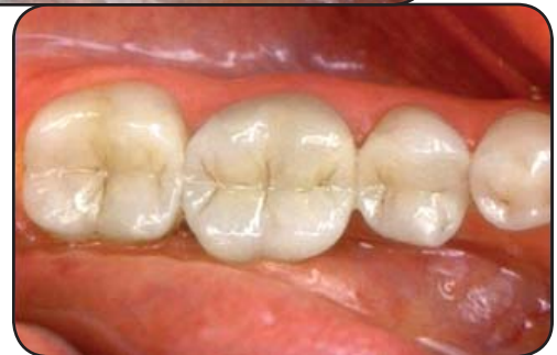
White restoration - before & after