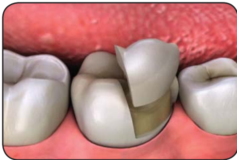
Placing an indirect restoration