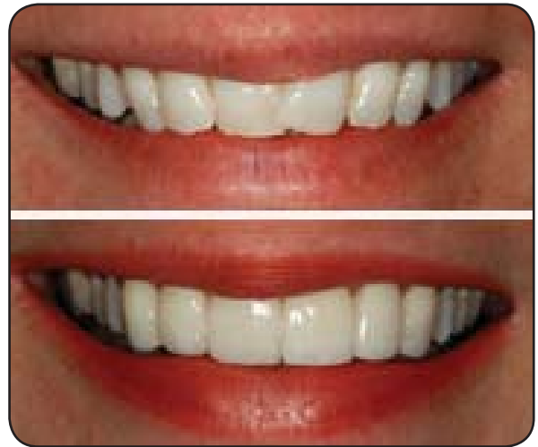
Before & after veneers