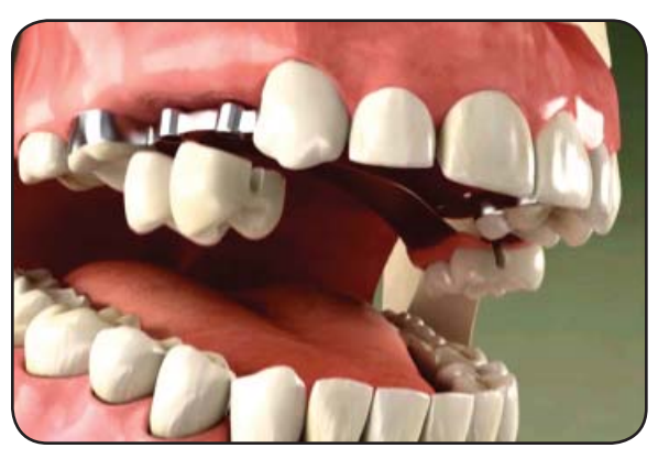
Precision partial in place

An accurate model of your mouth is made from these impressions, and the lab uses this model to create the precision attachments.