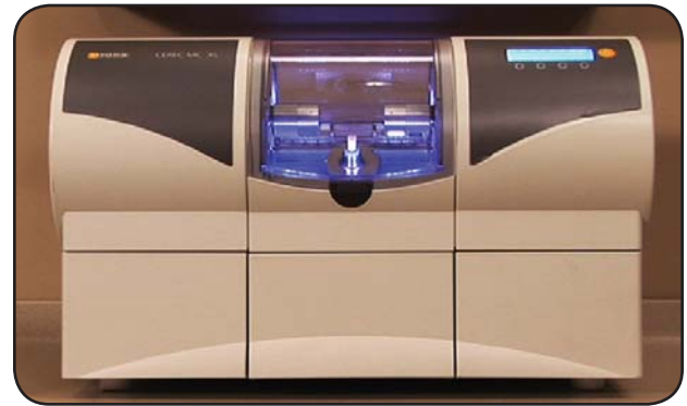
CAD/CAM milling machine