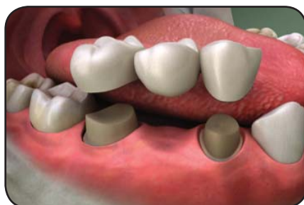
Crowns cemented into place