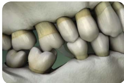
Opposing tooth extrudes